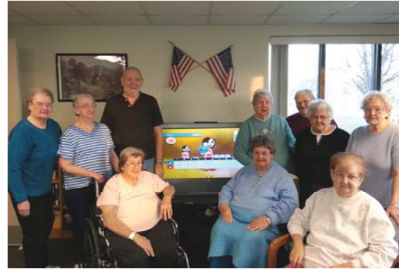
Tulpehocken Terrace Wii bowling gamers

Enhance the quality of life for older adults and disabled persons through your generous support of this project!