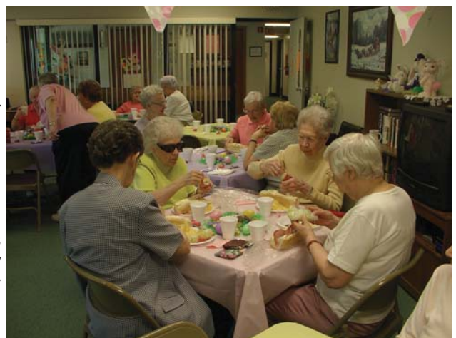
Residents of Poplar Terrace enjoy a meal together in their Community Room. During 2013, the Community Room kitchen was completely renovated and new furniture installed in addition to new sprinklers, wireless call system, hardware upgrades, keyless entry system and new public address system.