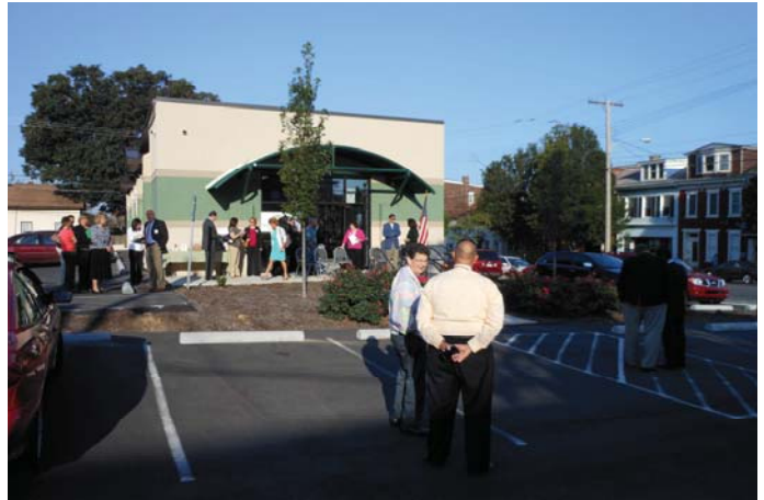
The 9th & Chestnut St. site for Lebanon Ridge Oral Health

Community Homes is seeking similar partnerships and visionary organizations to help build a better tomorrow for Lebanon County!