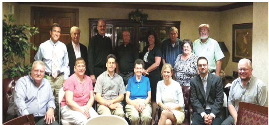
Community Homes Annual Shareholders Meeting August 21, 2013