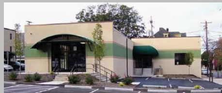
Lebanon Ridge Oral Health