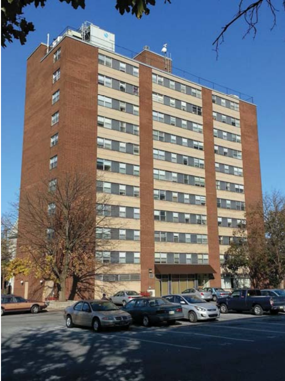
Willow Terrace Apartments

Reviewing the list of shareholders at left brings back memories for some Lebanon County natives. It was 45 years ago that this visionary group of community-minded organizations acknowledged a serious community need . . . quality housing for older adults. Inspired by this vision that something could be done about this growing need, they banded together to create Community Homes of Lebanon County. This organization would labor four more years until Willow Terrace became a reality providing 100 new apartments for seniors.