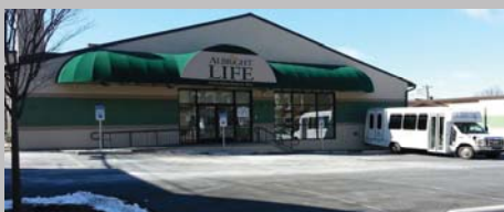
Albright LIFE Center